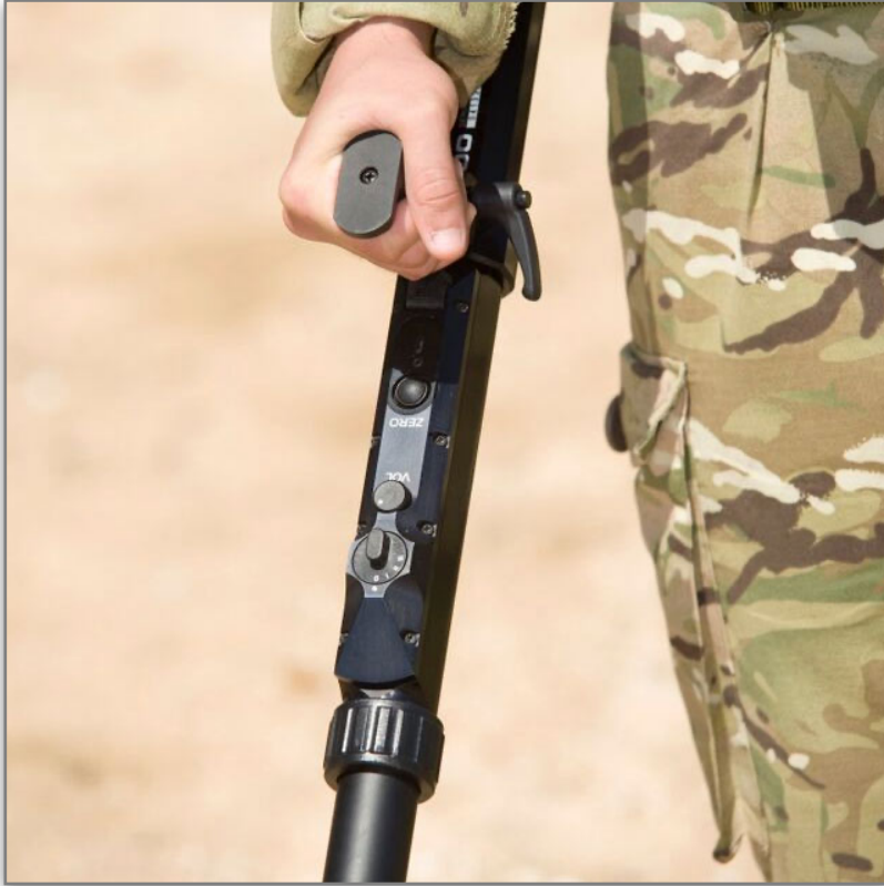
WD100 Control Unit & Handle