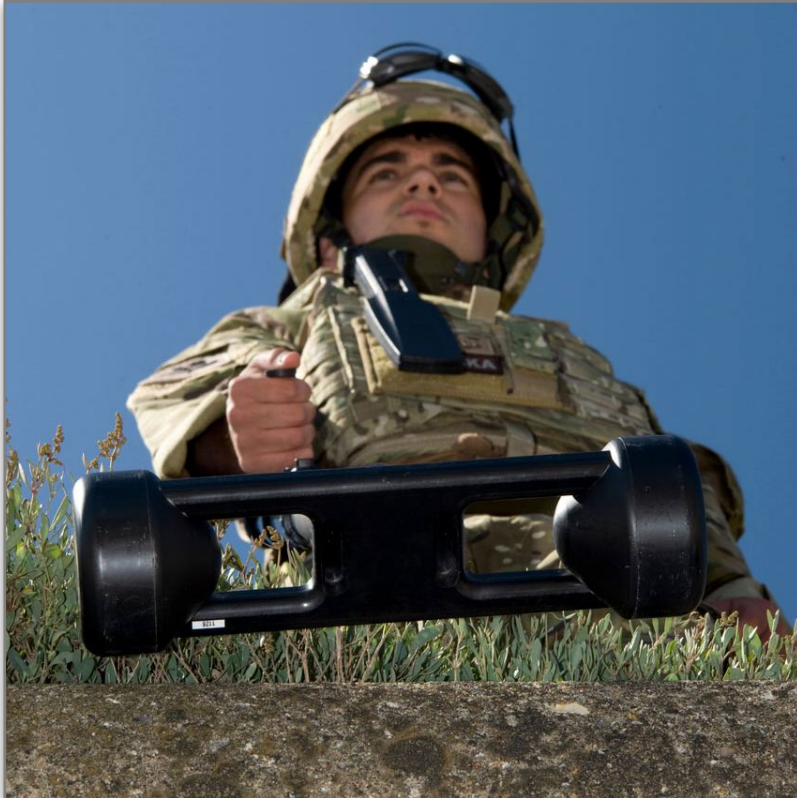
WD100 Sensor Head